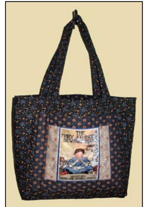
Tote Bag made from pattern using 2 - 5"x8" Quilt Blocks

Let us know if you or your customers have a request for any particular subject matter or location. We are a small company with a focus on quality and personal service and would be glad to work with you to accommodate your requests.