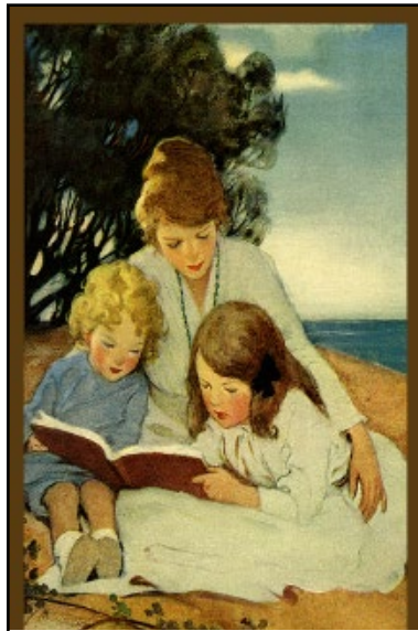
JWS_0005a - Reading a Book

note that she never had any children of her own. She was the first woman inducted into the Hall of Fame of the Society of Illustrators. All of Jessie Willcox Smith's sets can be seen on our web site.