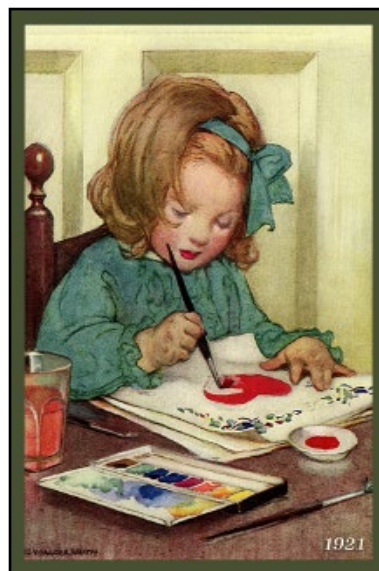
JWS_0007a - Girl Painting

The two images below are the front and back of our new fabric postcard. Each set of two will contain a pattern and a list of necessary components to make a quilted postcard. The finished postcard can be sent through the mail with a personalized message. The postcard will have to be hand cancelled to be mailed.