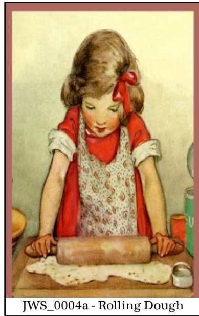
JWS_0004a - Rolling Dough

Jessie Willcox Smith was among the most gifted American artists of her time. She was born in Philadelphia and originally studied to be a kindergarden teacher. Jessie developed a talent for drawing, and at the age of 20 attended the School of Design for Women. She later studied at the Pennsylvania Academy of the Fine Arts under Thomas Eakins, graduating in 1888. She