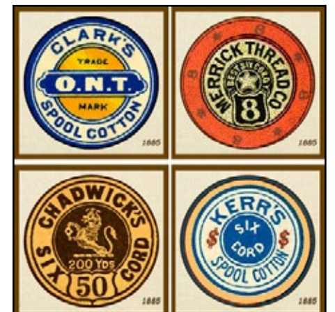
kSWHP_0003set - Spool Ends Set 3