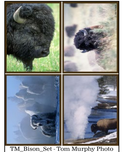
TM_Bison_Set - Tom Murphy Photo

Tom's photographs will be available in several formats, including wall hanging sets, tote bag sets, table runners, fabric postcards, and ornaments. His wildlife sets will contain animals such as moose, black bears, grizzly bears, polar bears, bison, elk, wolves, eagles, swans, penguins, owls, and small and baby animals.