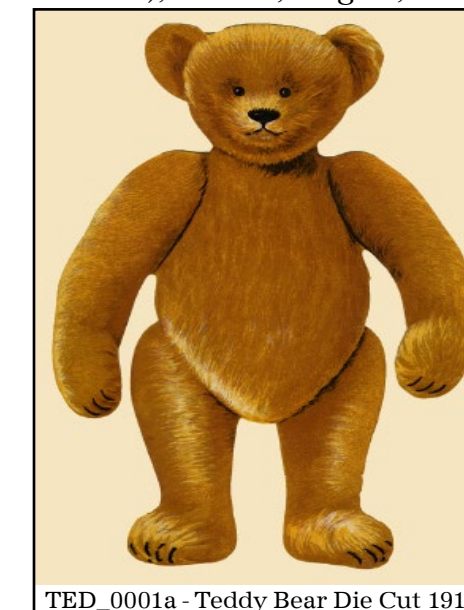
TED_0001a - Teddy Bear Die Cut 1910

We are introducing a new collection of die cut images and antique paper dolls in 2013. These collectible quilt blocks will come with a pattern to construct a free standing 3-D model such as Teddy Bears, Paper Dolls (with different outfits and dresses), Santas, Angels, or Christmas Trees, for example.