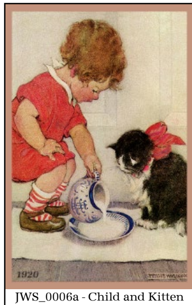
JWS_0006a - Child and Kitten

The four images on this page are from different Jessie Willcox Smith sets. The top image on the left shows a young girl rolling pie dough. This is from JWS Set 4 - Young Girls Working. The bottom image on the left is from JWS Set 6 - Toddlers. A young child is feeding a kitten milk in a bowl. The top image on the right is from JWS Set 5 - Mother and Children Reading. A mother is sitting on the beach with her daughter and son reading a book. The bottom image on the right shows a young girl making a watercolor painting in a scrapbook. This is from JWS Set 7 - Girls Pastimes. The images from these sets are illustrations from vintage books and magazines.