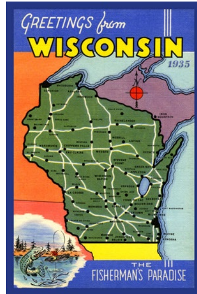
Wisconsin State Set 1 Wisconsin Map - 1935