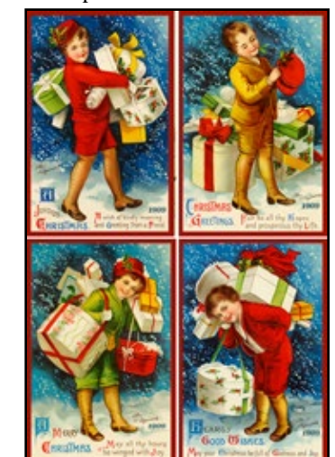
Christmas Set 9 Christmas Greetings - 1909