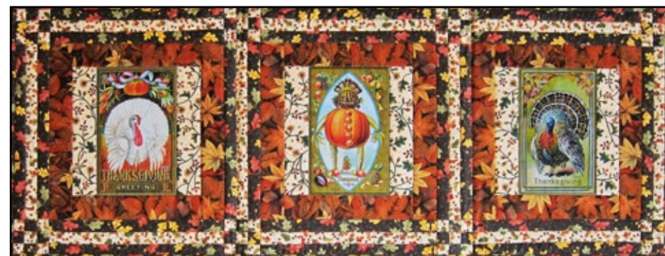
Thanksgiving Table Runner - 16x42 Set of 3 - 5x8 Quilt Blocks

We introduced table runners at Fall Market Houston in 2012 and they were a big hit. You can create your own customized table runner set from images you like. Let us know and we will be glad to work with you.