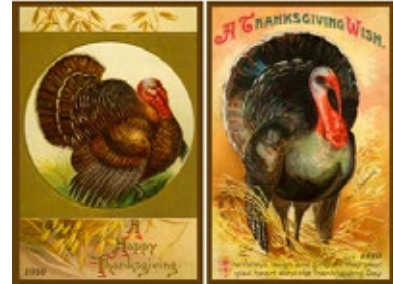
Thanksgiving Set 4 Turkeys - 1910