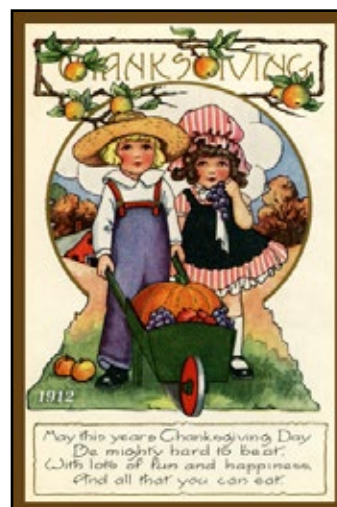
Thanksgiving Set 8 Children Gathering Food - 1912