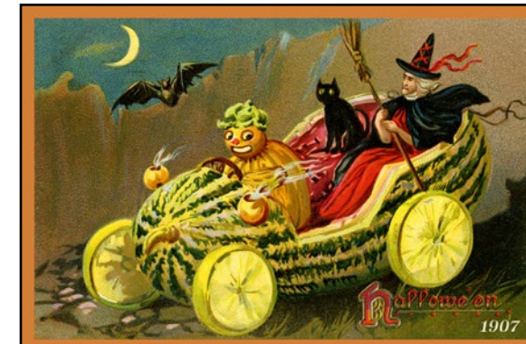
Halloween Set 17 Halloween Witch and Pumpkin Man - 1907