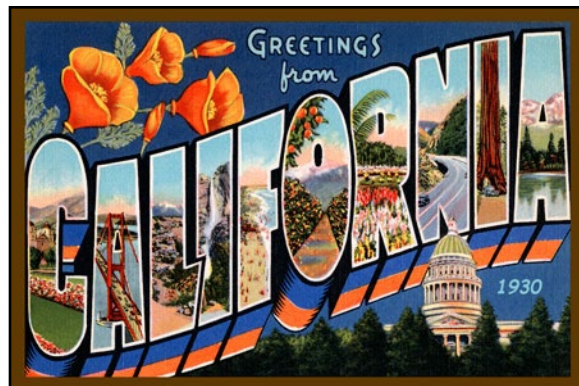
California State Set 1 California Large Letter - 1930