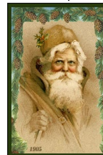
Santa Set 36 Santa Pinecone Border - 1907