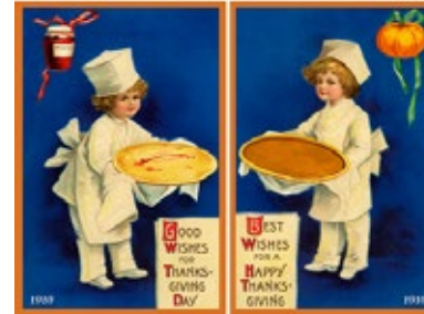
Thanksgiving Set 3 Boy Chef - 1910