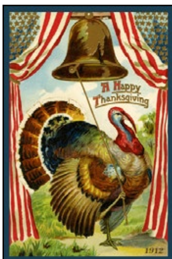
Thanksgiving Set 12 Turkeys and Flags - 1912