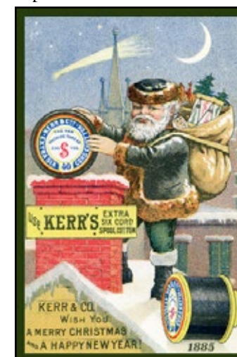
Santa Set 37 Santa & Kerr's Thread - 1885