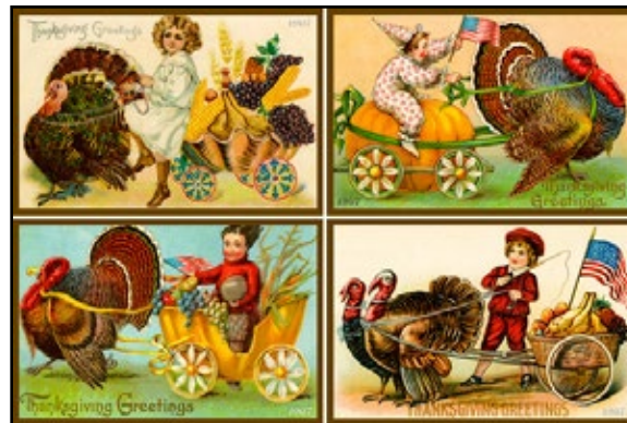
Thanksgiving Set 16 Turkeys pulling Carts - 1907

The early 20th century Thanksgiving images in our inventory are perfect for creating a traditional holiday theme. Our historical quilt blocks illustrate the holiday traditions as they were celebrated in the past. We recommend ordering some of our holiday quilt blocks.