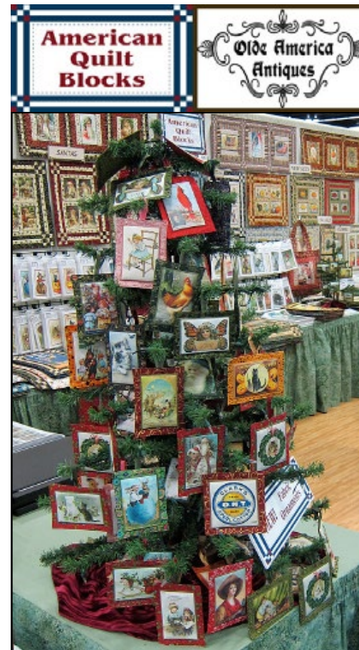
Christmas Tree decorated with Quilted Ornaments

Our ornaments make easy and fun projects for classes.