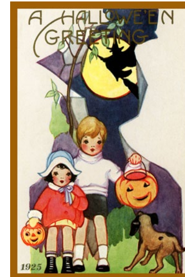
Halloween Set 12 Children Halloween Night - 1925

to placing orders for Halloween. This is a festive time of the year and signals a beginning to the fall holidays. We offer a wide range of vintage Halloween images. Our patterns include wall hangings, tote bags, table runners, ornaments, postcards, hot pads and pillows.