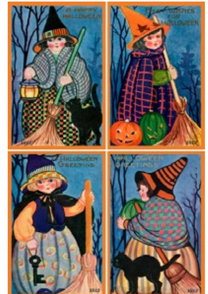
Halloween Set 16 Girls with Brooms - 1912