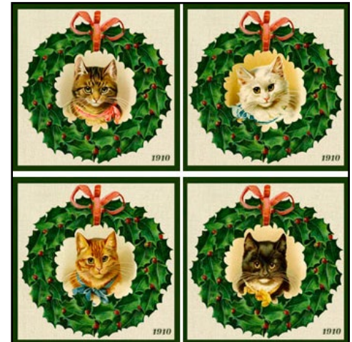
Cat Wreath Ornament Set Set of 4 - 4x4 Quilt Blocks