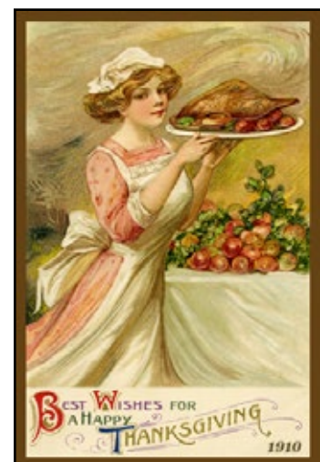
Thanksgiving Set 5 Women at Thanksgiving - 1910