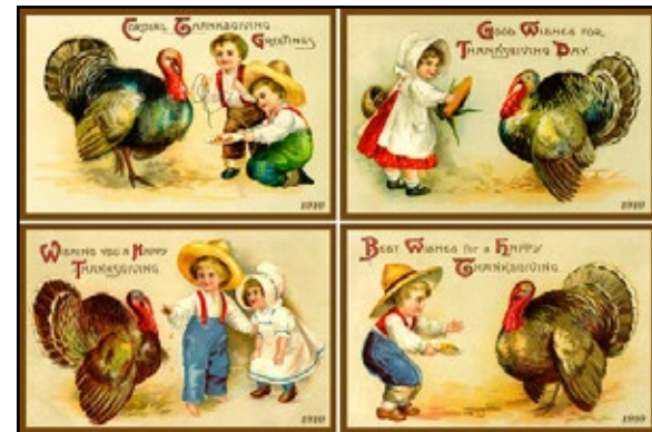
Thanksgiving Set 2 Children and Turkeys - 1910