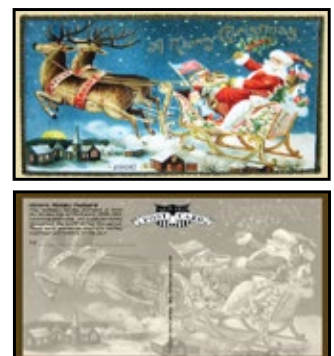
Postcard Front and Back Set of 2 - 4x6 Quilt Blocks

They are collectible, make wonderful gifts, and can be used for decoration. Consider ordering some of our fabric postcards for your shop or shop hop.