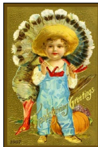
Thanksgiving Set 17 Children at Thanksgiving - 1910